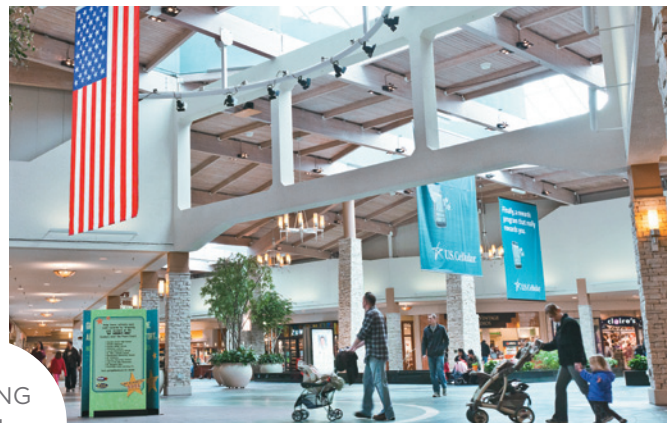
SPRING HILL MALL